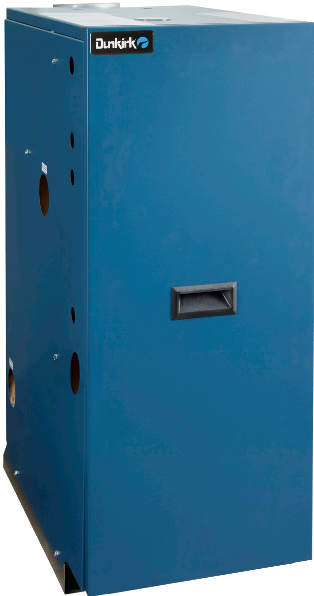
Dry Leg Casting