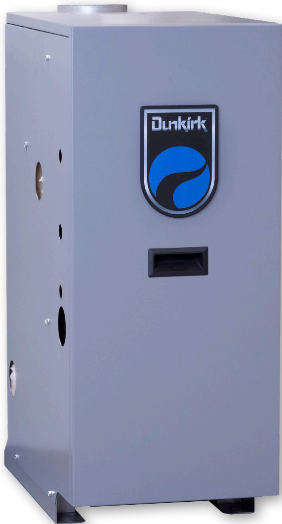
Dry Leg Casting