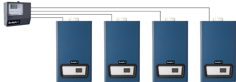
Shown with DMG 240

The MBC Boiler Control operates up to four boilers to provide outdoor reset operation, domestic hot water and setpoint operation with priority.