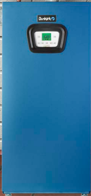
Floor Standing DCCF/DCBF