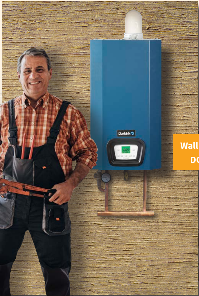
Wall Mounted DCC/DCB