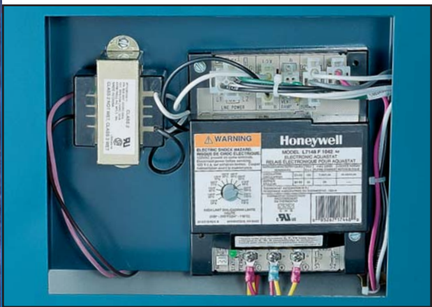
Enclosed controls feature a wire harness with Molex Plugs

The operation and safety controls for the Plymouth Xtreme are located underneath the jacket. Enclosed controls offer an additional level of consumer safety and minimize the possibility of damage during installation and operation.